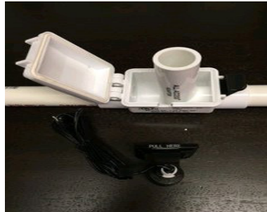
OPEN COVER TO INSPECT & CLEAR LINE