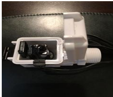
OPEN TO CHECK FLOAT SWITCH