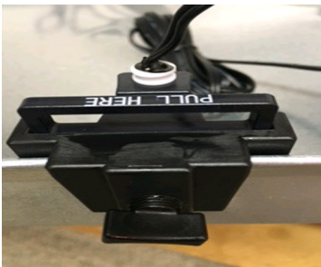
LOCK IT ON