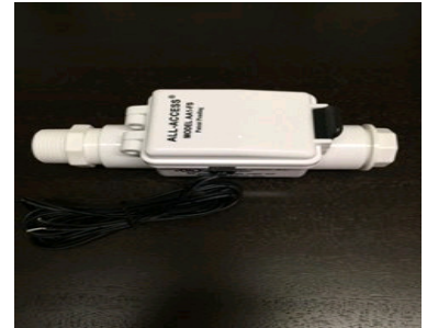
PLUGGED ON SECONDARY OUTLET