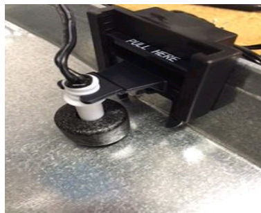
PUSH IT DOWN