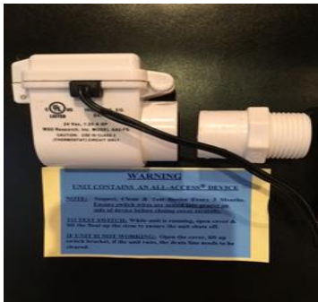
INCLUDES THREADED ADAPTOR