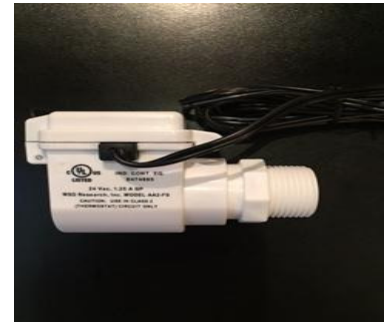
SMALLER & MORE SENSITIVE