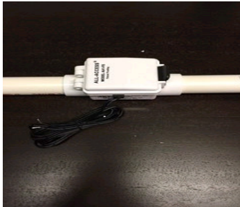
INSTALL IN-LINE OR SLOPED UP TO 45 DEGREES